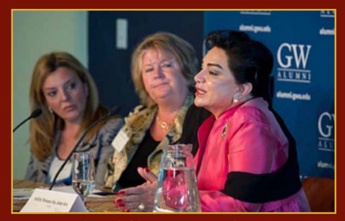
On the panel of the GW Women's Conference, USA