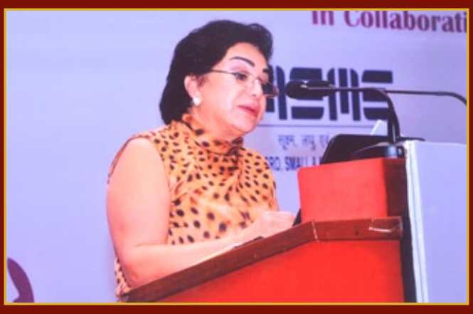
Speaking at the Conference of Women Entrepreneurs in Delhi